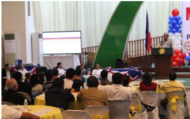
Asec Roosque Calacat recognizes the notable efforts of the province of Isabela in its fight against illegal drugs.