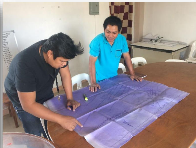
DED Preparation of the 2016 BUB-Water Project in Basco, Batanes