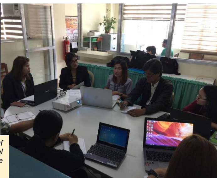
Orientation On Online System For Application Of Foreign Travel Authority attended by the Provincial Focal Persons and IT staff of the difference Provinces except Batanes