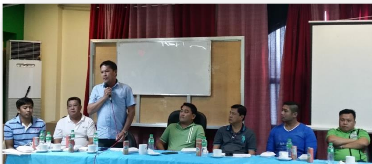
With LGU-Cauayan City, Isabela on March 07, 2017

The activity was conducted to get updates on the status of 2014, 2015 and 2016 BUB Project implementation; to discuss problems and to address the same; and to identify actions to be undertaken to fast track the implementation of projects.