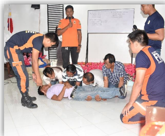
LEARNING MADE PRACTICAL The BFP personnel demonstrating the Basic Life Support and Emergency & Rescue Transfer; the participants took part as they conduct return demo.