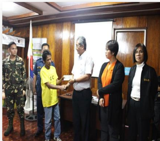
Awarding of check to former rebels