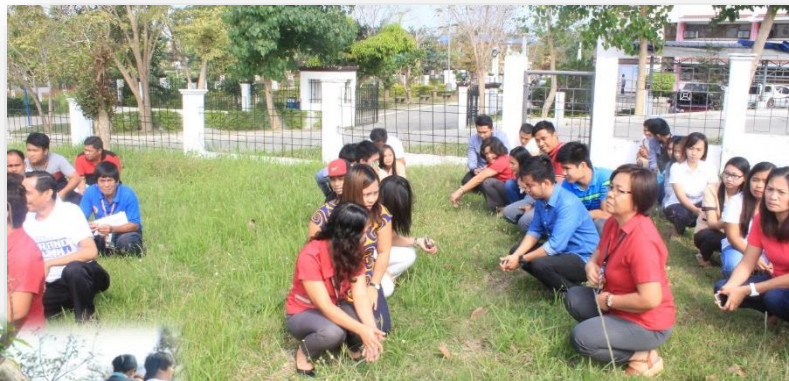
Accounting of personnel at the command post