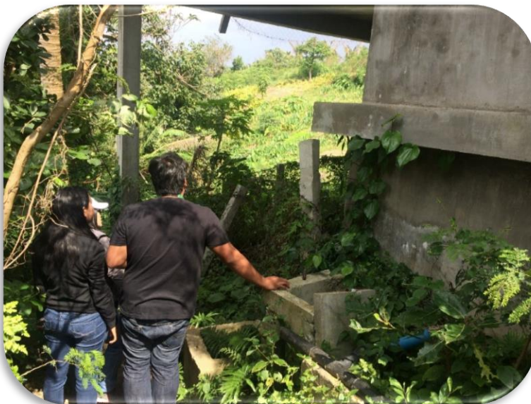
Site inspection at Basco, Batanes for their 2016 BUB-Water Project