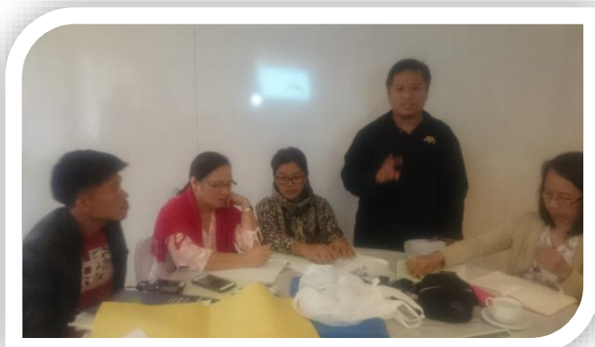
Participants of LGU Sta. Ana presenting their workshop output during the RS4LG diagnosis workshop.