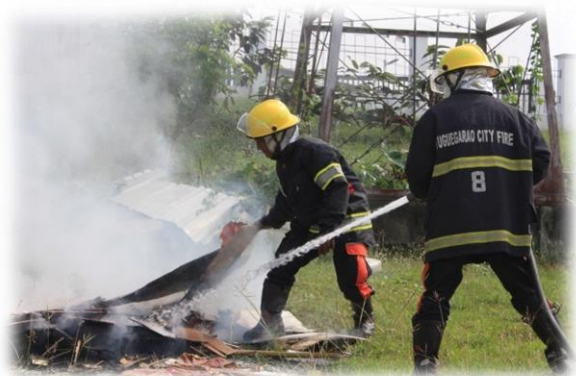
Firemen trying to suppress the fire