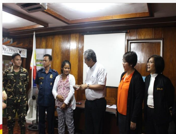
Awarding of check to former rebels

After the conduct of the validation/verification of former rebels (FRs) on October 12, 2016, an awarding of checks representing the financial assistance, specifically, Emergency Assistance and Livelihood Assistance amounting to a total of sixty-five thousand pesos each (P 65,000.00) was awarded to FRs on January 10, 2017 at DILG