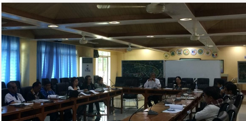
RPRAT-RDs Meeting on January 27, 2017 at NEDA 02 Pamegafanan Hall, Tuguegarao City