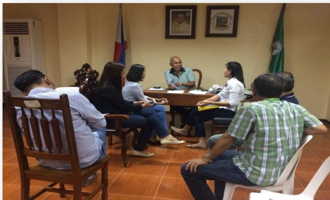
CSIS Marketing with Mayor of Bayombong, Nueva

Having been able to communicate the purpose and desired results of the CSIS, two (2) municipalities as shown on the table above shall be implementing the project this year. The Regional Technical Action Team shall extend the necessary assistance and coordination to ensure the smooth flow of project implementation in the 2 municipalities.