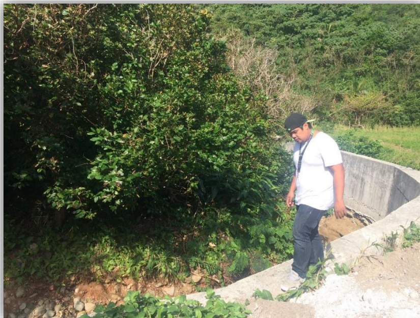
Project validation of the 2015 BUB Project: Drainage Canal at Sabtanq, Batanes