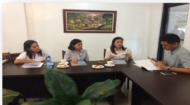
CSIS Marketing with Mayor of Roxas, Isabela.

As part of the monitoring and evaluation, the RFP visited the three (3) cities in Isabela- Santiago City, Cauayan City and City of Ilagan, where the CSIS Project was already implemented in 2014, to monitor the implementation status of their Citizens-driven Priority Action Plan (CPAP). The monitoring was conducted to validate whether the City Governments were able to accomplish the necessary interventions incorporated in their CPAP.