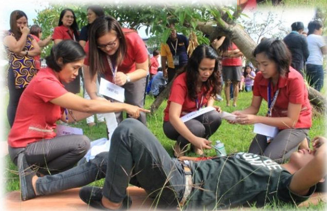
First aid treatment given to the victim