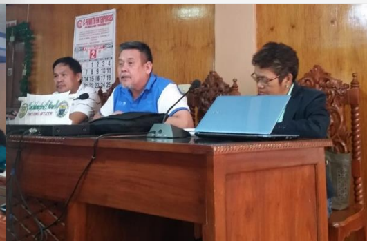
With LGU-Cauayan City, Isabela on March 07, 2017