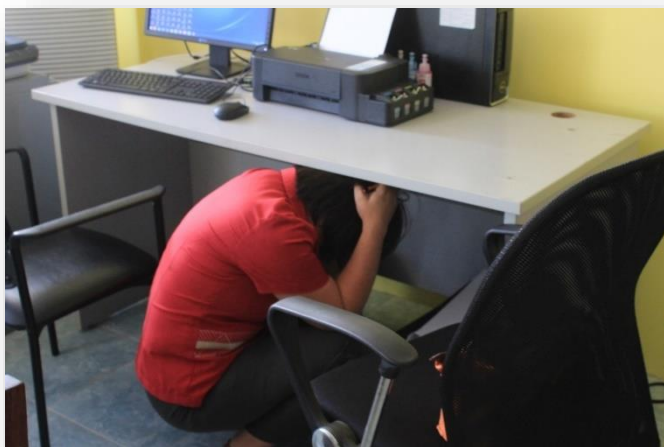
Personnel doing the "duck, cover and hold"