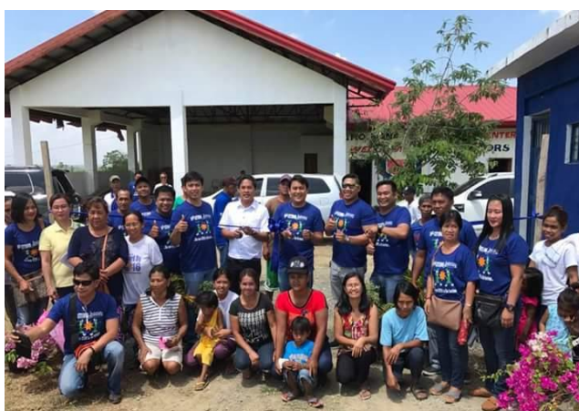
PD Elpidio Durwin, CESO V attends the inauguration of FY 2015 Construction of Level II Water System located in Sitio Manalpaac, San Pablo, Cauayan City on March 30, 2017.