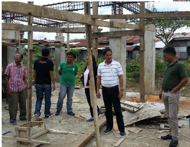
DILG-BUB Evacuation Center at San Pablo, Isabela on March 08, 2017