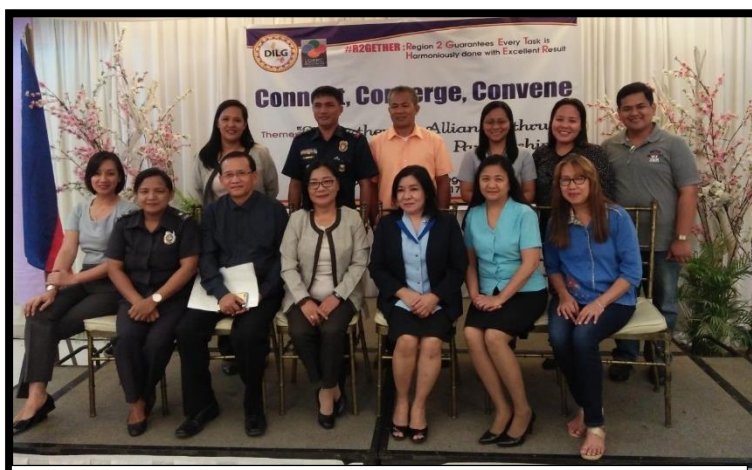
RTWG Members present during the signing of the Joint Memorandum Circular and Memorandum of Understanding RTWG on March 21, 2017 at Crown Pavilion

A Memorandum of Understanding (MOU) was also signed between and among partner agencies, interfaith groups, academe, and other institutions that have stake and concern on anti-illegal drugs effort.