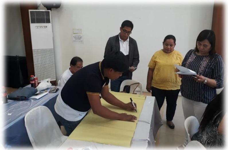
C/MLGOOs actively participate in the workshop