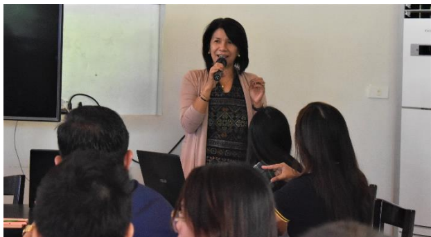
During the opening program of the CMGP Benchmarking and the National Year-End Review, Assessment and Planning Workshop for CY 2019 Blueprint at Water Sports Complex, Quirino Province.