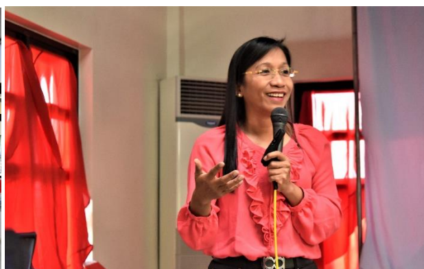
During the SLGP Training-Workshop at Quirino Water Sports, Quirino Province on October 22-26, 2018.