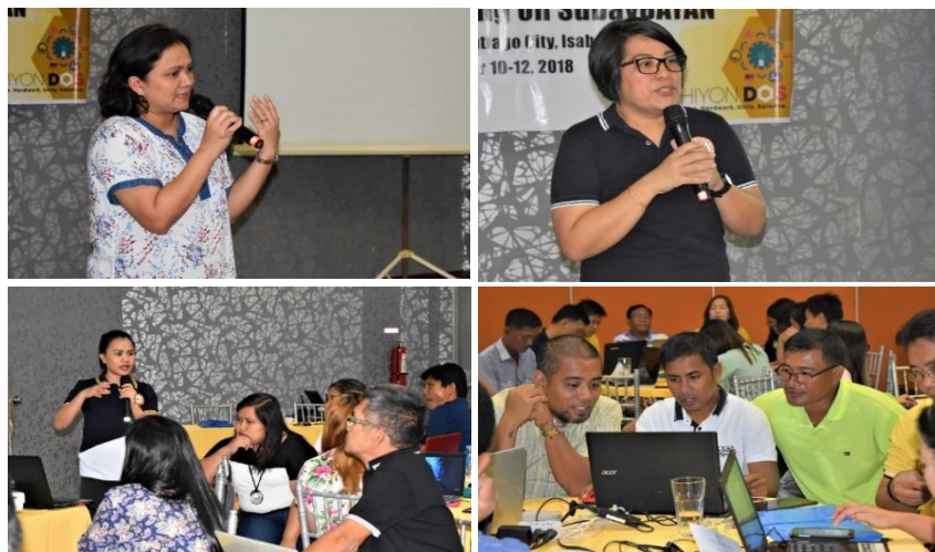
During the orientation and workshop of the two platforms dubbed SubayBAYAN and DevLIVE held at Zen Hotel, Santiago City on October 8-11, 2018.

The Department of the Interior and Local Government, in partnership with the UNDP, developed a project called “Development LIVE: achieving SDGs in Infrastructure through Local Integrity, Innovation and Citizen Empowerment.” Development LIVE (DevLIVE) is an online data capture and visualization platform that will serve as a monitoring feedback tool for LGUs, CSOs, and government personnel, thereby fostering a state-society partnership that is participatory, transparent, and ultimately democratic. Meanwhile, “SubayBAYAN” (SubayBAYAN ang Proyektong BAYAN) formerly known as Programs and Projects Management System (PPMS) is an online platform administered by the DILG for the reporting, monitoring and providing the public with an accurate information on the implementation of OPDS-Locally Funded Programs/Projects (LFPs).