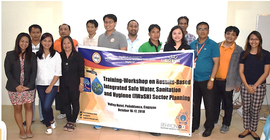
The resource speakers, facilitators, and participants of the Seminar Workshop on Results-Based Integrated Safe Water, Sanitation and Hygiene (iWaSH) Sector Planning