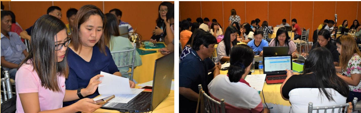
Hands-on training of the participants on SubayBAYAN and DevLIVE platforms.

To facilitate and maximize both platforms, orientation and training of concerned persons ensued. Spearheaded by the DILG 02 – Regional Project Management Office (RPMO), series of activities were held on October 8-11, 2018 and November 19-20 2018 at Zen Hotel, Santiago City.