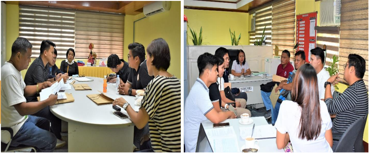
The RPRET consolidates findings and evaluation for the nomination of selected LGUs for the 2018 ADMIRE.

Aimed to assist in strengthening the capacities of the LGUs in the area of water supply and sanitation, the DILG, thru the Office of the Project Development Services-Water Supply and Sanitation Program Management Office (OPDS-WSSPMO) and the Regional Project Management Office (RPMO), conducted a Training-Workshop on Results-based Integrated Safe Water, Sanitation and Hygiene (IWaSH) Sector Planning on October 16-17, 2018 at Valley Hotel, Penablanca, Cagayan. The activity was participated in by LGU functionaries of Claveria, Cagayan and Kasibu, Nueva Vizcaya such as the Local Government Operations Officer, Municipal Local Government Operations Officer, Municipal Engineer, Municipal Disaster Risk Reduction Management Officer, Municipal Engineer Officer, Admins and other technical staff.