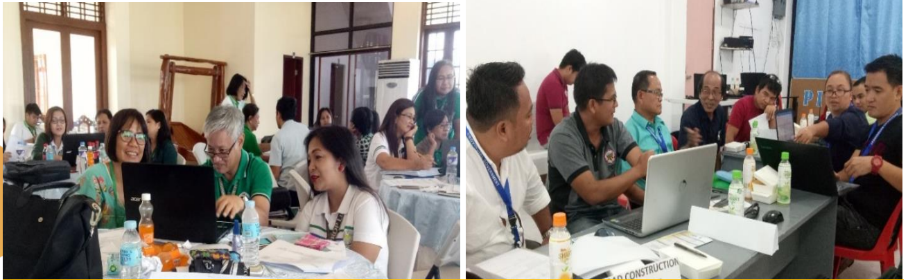
The participants identify the strengths, weaknesses and current situation during the assessment on Local Road Management and Public Financial Management and Public Financial Management

Lastly, the RPMO spearheaded the first ever CMGP Benchmarking on November 27-28, 2018. A total of one hundred eighteen (118) delegates from the Office of Project Development Services (OPDS), Local Road Management Teams (LRMT) of Region 02, the Department of the Interior and Local Government (DILG) Regional Offices across the country, the United Nations Development Programme and other key players actively participated in the Benchmarking on Conditional Matching Grant to Provinces (CMGP) Program Governance Reforms cum National Year-End Review, Assessment and Planning Workshop for CY 2019 Blueprint at the Quirino Water Sports Complex, Cabarroguis, Quirino on November 27-28, 2018.