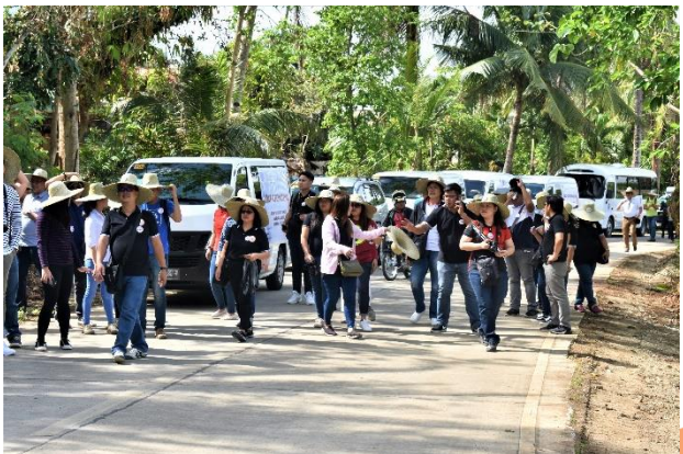
On-site project visits of CMGP road projects in San Marcos, Balagbag-Rizal Road and Pinaripad Sur-Diodol Road in Quirino .