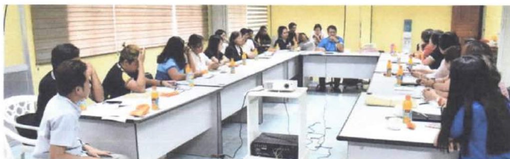
COA exit conference with the resident auditor and DILG RO2 team on Feb 27, 2018 at DILG RO2 conference hall.