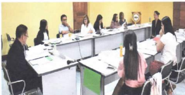
Applicants during the interview