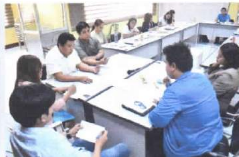
Applicants during the group dynamics

Out of the above-mentioned activity, the following were appointed/promoted: