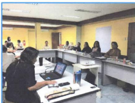
Regional and Provincial Management Team Meeting with the LRI Representatives