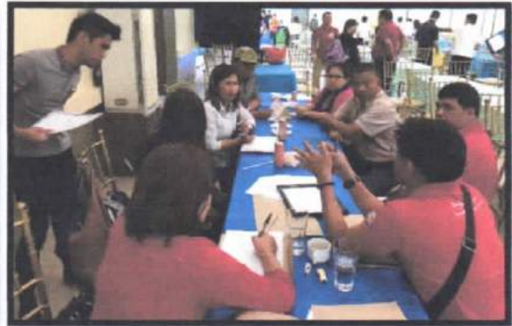
LGDO V Baguisi convenes the eight target LGUs on RS4LG and P4 and discusses briefly the status of LGUs in compliance with the requirements of the said program