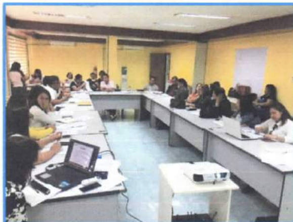
Follow-up Meeting with LRI Representatives relative to the Conduct of Sangguniang Kabataan (SK) Mandatory Training