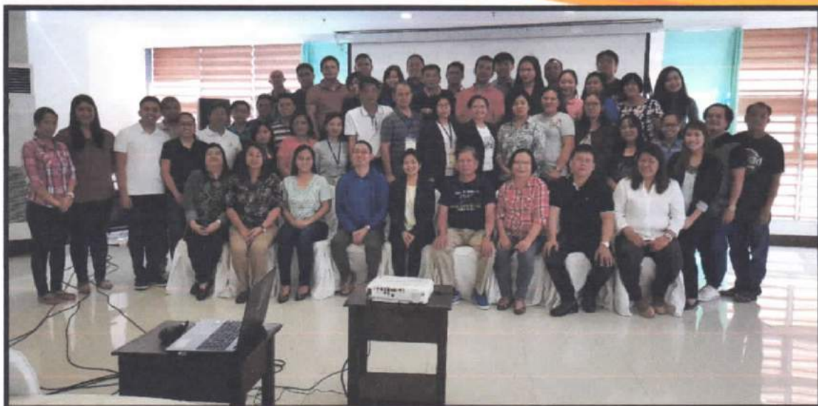
Participants and training management after the closing ceremony